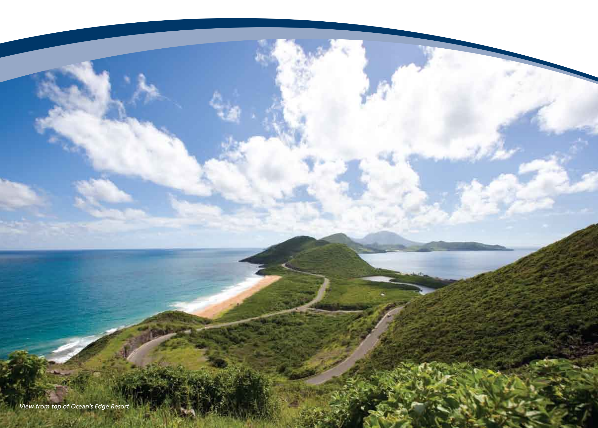
View from top of Ocean's Edge Resort